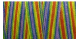
Jelly Beans 242-30-01V