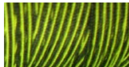
Northern Lights 242-30-2BG