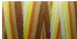
Indian Simmer 242-30-03V