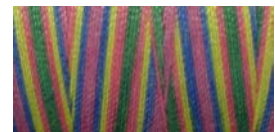
Baby Booties 242-30-02V