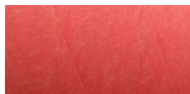
Hot, Hot Pink 242-30-N03