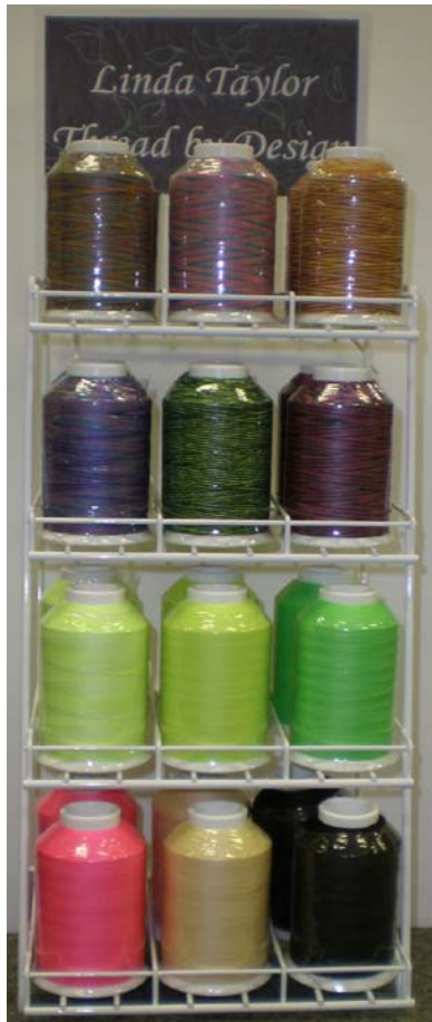
242-WR-001 Filled with 2 each 12 colors

Specially designed for YLI by Linda Taylor to "show off" the quilting design.