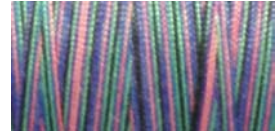
Crown Jewels 242-30-04V