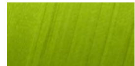
Highlighter Yellow 242-30-N01