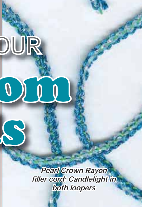
Pearl Crown Rayon filler cord; Candlelight in both loopers