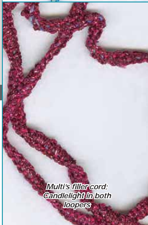
Multi's filler cord; Candlelight in both loopers