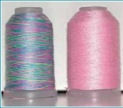
YLI Jeans Stitch