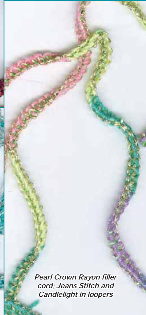
Pearl Crown Rayon filler cord; Jeans Stitch and Candlelight in loopers