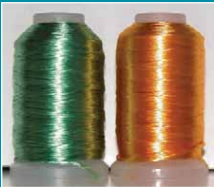
YLI Designer 6