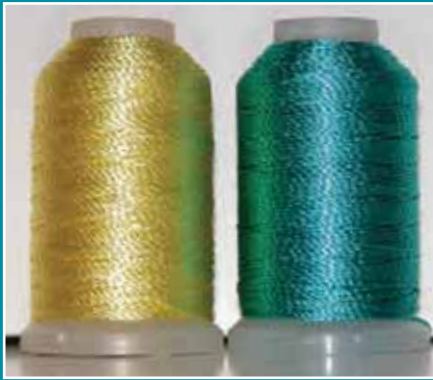
YLI Pearl Crown Rayon