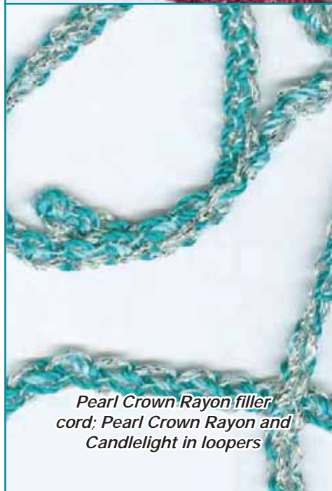
Pearl Crown Rayon filler cord; Pearl Crown Rayon and Candlelight in loopers

It may take a bit of experimentation to get the exact color and size combination, but the mixes shown here provide a starting place. Audition your threads by twisting them together. The color of each one in the mix does make a difference.